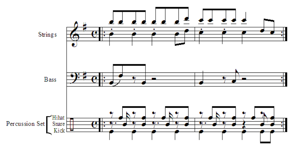
Figure 15: Melodic motifs in Toto Millionaire

(Above) the dominant melodic motif that recurs in various timbres and fragments throughout the film and (below) the upbeat genge -type instrumental groove that recurs with some variation in the film (repeat marks are used to indicate its length and not the number of times it is repeated)