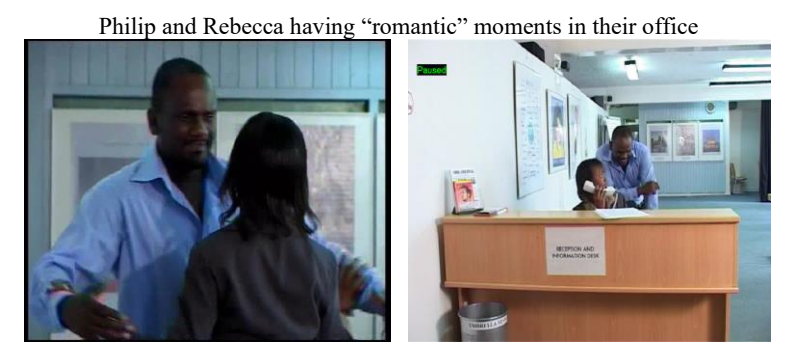
Figure 21: Early scene entry in Toto Millionaire

Philip heads back to his office as Toto enters the frame.