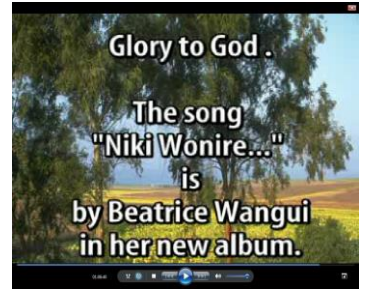
Figure 12: Diegetic and non-diegetic use of songs in Njohera

Other diegetic sounds are environmental. They include birds chirping, a cock crowing, a cow's moo, a radio and other noises that serve spatial and contextual functions. Some of these sounds also invade the diegesis. An example is where an unintended grating sound causes Wa Gacuma to cringe. Another is the sound of a cup's contact with Wandahuhu's teeth that reveals it to be empty while purportedly at least half-filled with porridge.