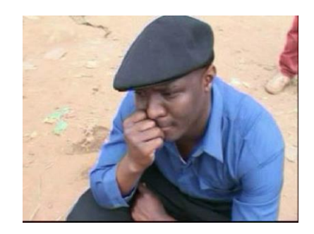
Figure 2: Externalisation in Kikulacho

Kikulacho's methodical manner is best exemplified in its use of conventional techniques such as shot/reverse and establishing shots without making more spatial meaning than just to tell us "this is where we are and this is what is going on". For example, the series of long shots of buildings and other objects that depict the Nairobi cityscape at the start of the second part of the film (scene 7) are all at a low angle that establishes little spatial relationship, neither between them nor with the significant action that follows. A classical establishing shot would use an aerial angle that zooms in from an extremely long shot in a manner analogous to literary descriptive passages, to zero in on the significant action in a manner analogous to literary dialogue passages. However, given the illustrational functioning of the sequence in Kikulacho , the viewer gets an accurate, though approximate, picture of the location of action the same way he/she does from the transitional shots of a mansion.