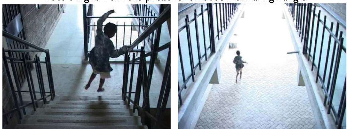
Figure 8: The running motif in Toto Millionaire

Toto's flight from the preacher's house from a high angle